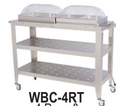
WBC-4RT 4 Pans & 2 Rolltop Lids

4 Pans & 4 Individual Lids 1 Cutting Board